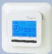
Central Control System