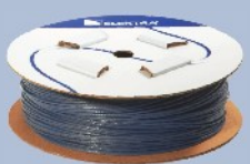
Ultra-thin Heating Cable